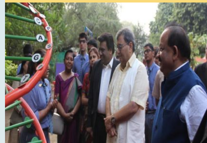
Guests at the science park