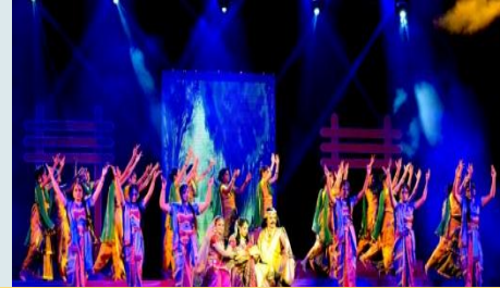
Scenes from Tathagat