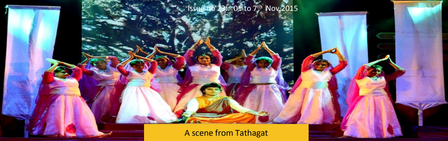
A scene from Tathagat