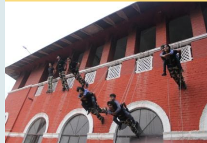
The Modern Daredevils