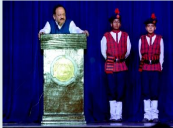
Mr Harsh Vardhan