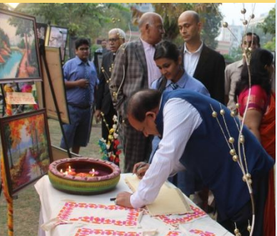
Chief Guest Dr Harsh Vardhan writing a few lines of appreciation