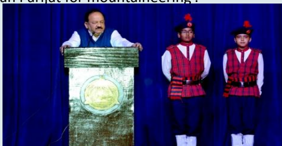
Dr Harsh Vardhan addressing the audience