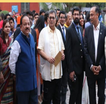
Guests At The Technology Block