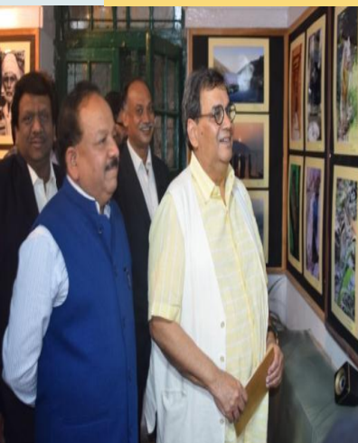
Guests Admiring Photographs