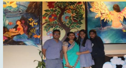
Students flaunt their art work