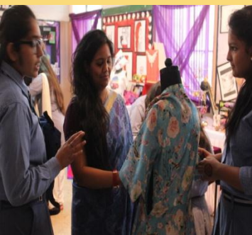
Fashion design model

The Fashion Technology Department displayed various dresses made by the students and eloquent coloured designs in a very tasteful manner.