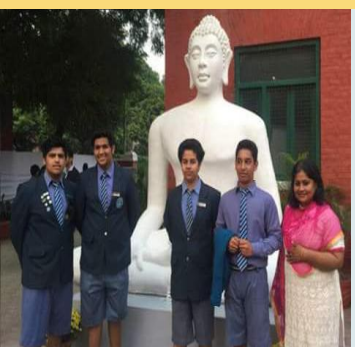
Beside The Statue Of Buddha

Students of this department made a magnificent idol of lord Buddha which was an added attraction that stood out among the rest. It presented their hard work, skill and talent.