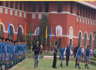
The Guard of Honour

The Guard of Honour was inspected by the Chief Guest, Dr. Harsh Vardhan. The band comprising of S3 students played different compositions while in the background there was a majestic display of horses. Students of S3 welcomed the chief guest and the guest of honor with much gusto and delight.