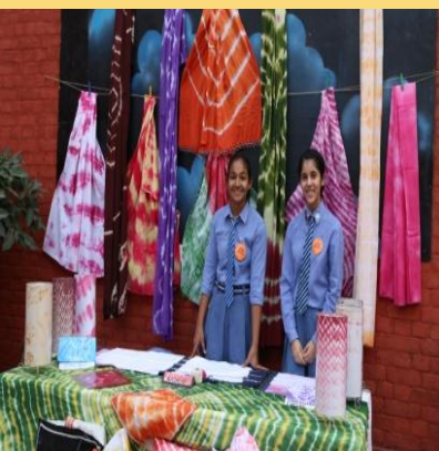
Home science students

Lens craft the Photography Club of Modern School organized a photography exhibition. There was a display of beautiful pictures clicked by the students of the school from class S1-S7. The pictures had covered all aspects of photography like portraiture, nature, street, macro and wildlife. The photography room was decorated with rose petals and the soft sound of piano music pervaded, along with a soothing aroma, that created a vibrant environment for our chief guests.