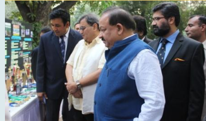
Sports trophies on display