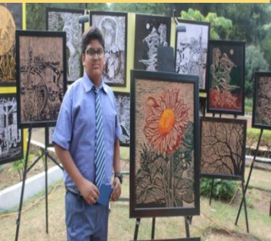
Graphic creations by Manav

Quilling is an art form that involves strips of paper that are rolled, shaped and glued together creating beautiful and fascinating designs. Quilling exhibits were put up by Aishwarya Aggarwal S2 and Arjun Narula S4 displayed photo frames, greeting cards and jewellery.