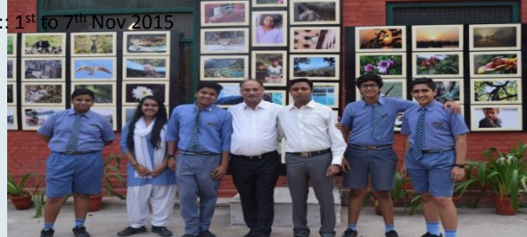
Guests At The Photography Display