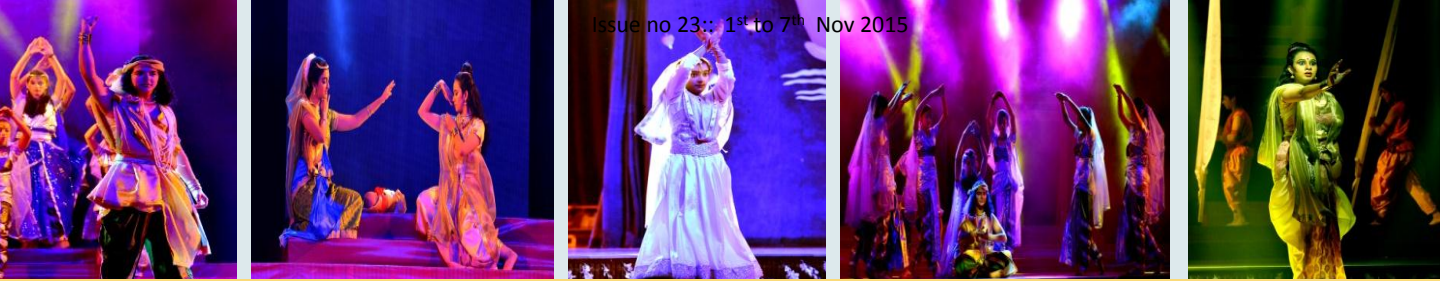
Glimpses From The Ballet 'Tathagat'