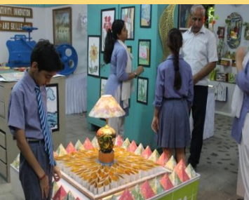
Paper technology department

Students presented an enormous display of art work such as paper mache, quill work, handmade trays and photo frames in the paper technology room.