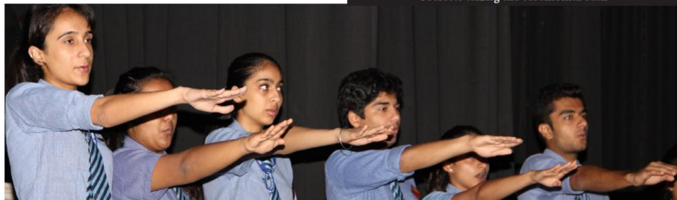
Prefects taking the ceremonial oath