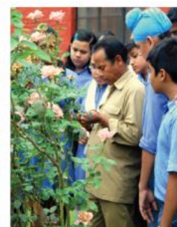
Gardener at work