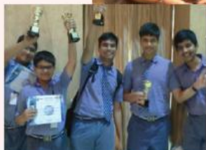
The team with their trophies