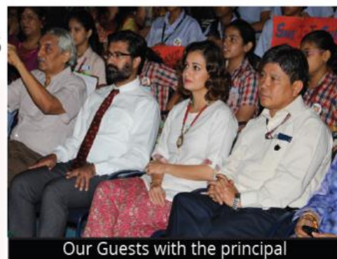
Our Guests with the principal

A dance performance: 'Born to be free' and the 'Earth Song' by Modern School had Dia Mirza and the hall give a standing ova- tion.