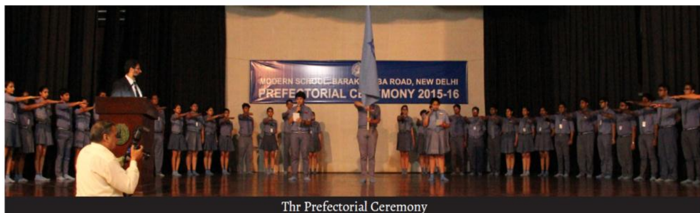
Thr Prefectorial Ceremony