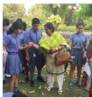
Teachers educating students

Gardening is an integral part of the school activities wherein the students of S4 & S5 learn the art of grafting, vegetative propagation, and sowing of a sapling.