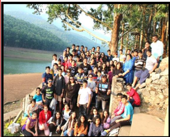
At Echo Point, Munnar