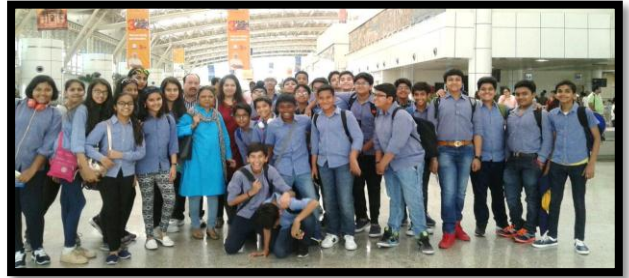
Students at Bhubaneswar airport

A four day trip from 18 th to 21 st March 2018 was organized for 73 students of class S2 to Puri and Bhubaneswar in Odisha. The students frolicked around a beautiful beach on the day of arrival and witnessed a mesmerizing sunset. The next day started with a visit to the famous Konark Temple. Replete with ancient stone carvings, it was an informative experience for the students which gave them an insight into the rich historical past of India. The ancient sundial left each one of them awestruck with its accuracy of time. Students paid their