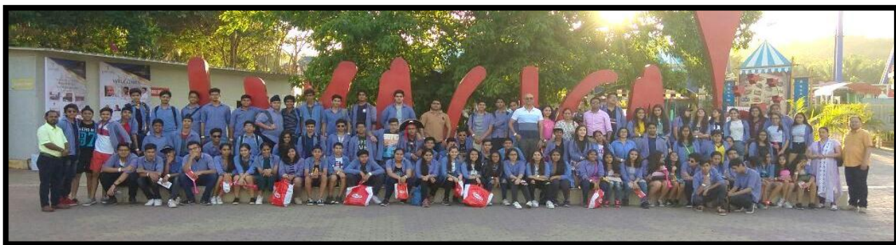
Students outside amusement park - IMAGICA

On the 17 th of March 2018 the S4 students boarded their flight to Pune, Maharashtra. The students visited the Agakhan Palace which infused in them the sense of patriotism as they learnt about the struggles and sacrifices of Mahatma Gandhi. The next day they visited Panchgani, a beautiful hill station in western Ghats of India where they took a challenging trek which taught the importance of team work amongst the students. The visit to strawberry jam factory at Mahabaleshwar helped the students to understand the hard work involved in making the all time favourite strawberry jam. The long journey to Mumbai wore off after they took the most thrilling roller coaster rides in the amusement park IMAGICA. The Gateway of India and the Elephanta Caves enriched the students with rich heritage of our country. It was a memorable learning experience which would be cherished by everyone.