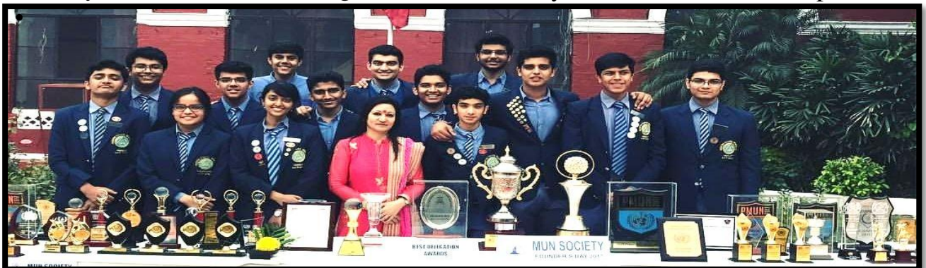
Students of the MUN Society with their trophies