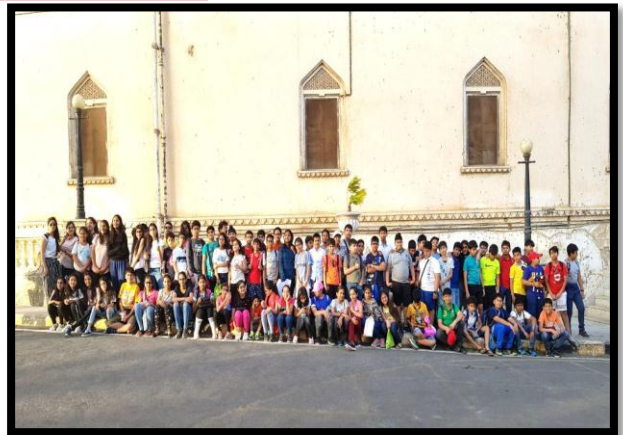
Students outside city palace- Udaipur

The school organised a trip to the visually and culturally rich cities of Kumbhalgarh, Chittorgarh and Udaipur from 19 th to 22 nd March 2018. The children visited a variety of forts and palaces, where they gained new insight in the way history is learnt : “not merely by reading but by immersing in the creations of the past.” They showed great response to the stories of the great kingdoms and battles, as well as to the architecture of the colossal palaces made by the kings of Rajasthan.