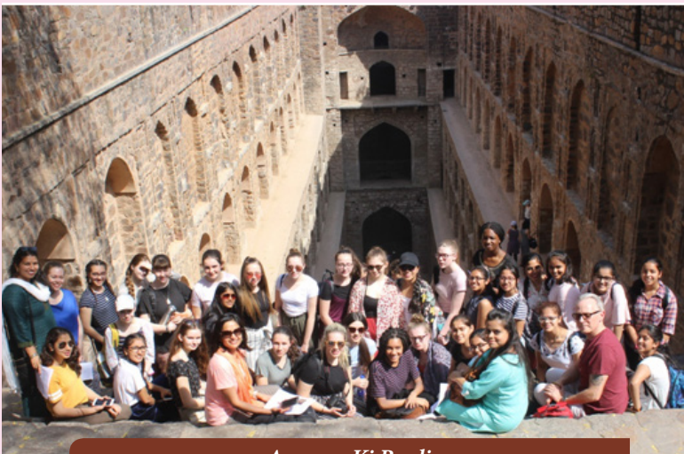
Agrasen Ki Baoli

On the following day the students got an opportunity to take a peek of a city steeped in history. They witnessed our culture and heritage while touring the city. During the tour they visited important landmarks of Delhi like Red Fort Humayun's Tomb- the tomb of Mughal emperor in India, Rajghat- the memorial of Mahatma Gandhi, Agarsen Ki Baoli- a 60 meter long and 15 meter wide historical step well, India Gate- a war memorial.