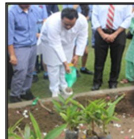
Mr. A.A.Khan, The Environment Minister planting a tree