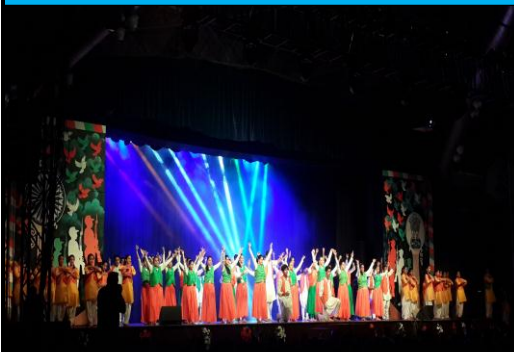
DANCERS PERFORMING THE 'ROPAK'

The limelight of the celebration was the Roopak titled "Kar Chale Hum Fida Jaano Tann Saathiyon, Ab Tumhare Hawale Watan Saathiyon" which was performed against a background of patriotic songs, sung by our school choir. Flag hoisting, the Principal's Address, the Chief Guest's Address to the students, talks in English & Hindi were the other highlights of the celebration.