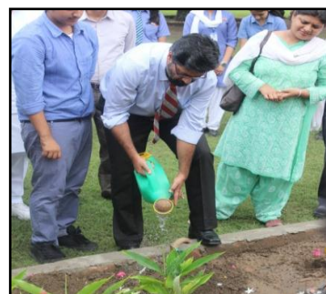
Principal Sir ,Planting a Cardamom tree