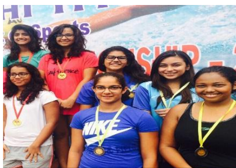
The Relay team with their Medals