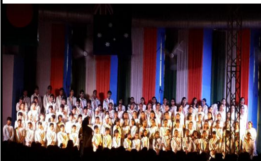
SCHOOL CHOIR IN ACTION