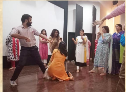
TEACHERS AT THEATRE WORKSHOP

(a) Name Tapes (b) Name and Gesture (c) A/B Freeze Tag (d) Building Tableaux (e) Meaning Making- Wants, Needs and Desires (f) Hot Seating Group Work, Flesh Out a Character (g) Gallery of Characters.