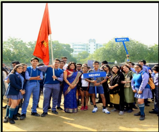
The Nehru House