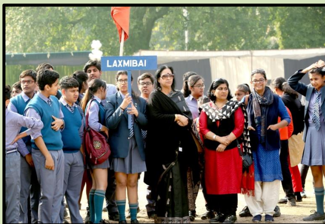
The Laxmi Bai House