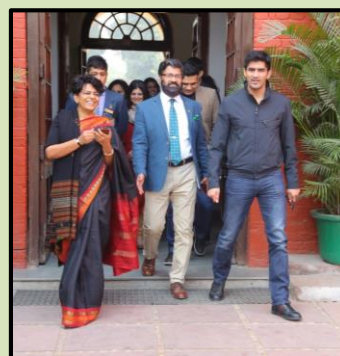
The Principal escorting the guests