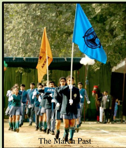
The March Past