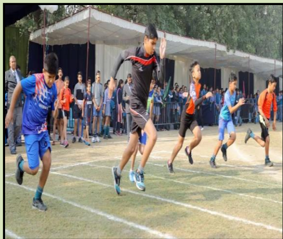
Students at the race