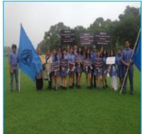
Modernites ready to move on a walk for a cause