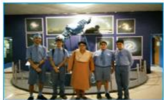
Students at the planetarium