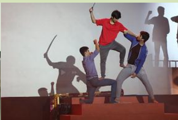
99 th Founder's Day practice sessions