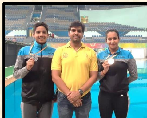
Awardees at the Talkatora Stadium