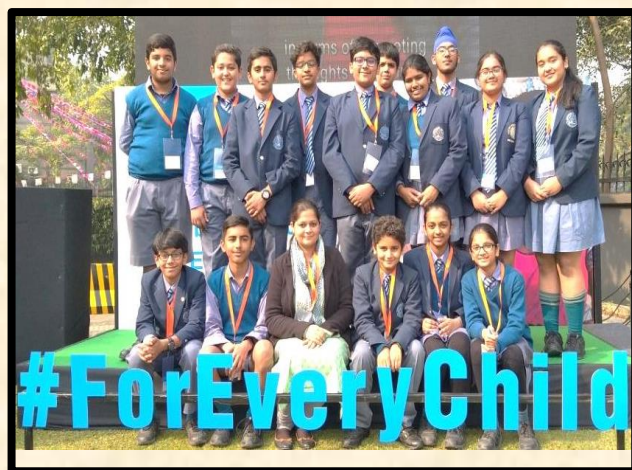
Participants at the UNICEF Event

The students got a valuable insight into children's rights and understood the importance of UNICEF as an organization.