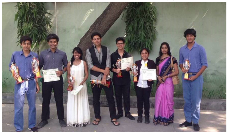
Student's With Their Trophies