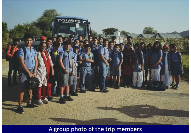
A group photo of the trip members