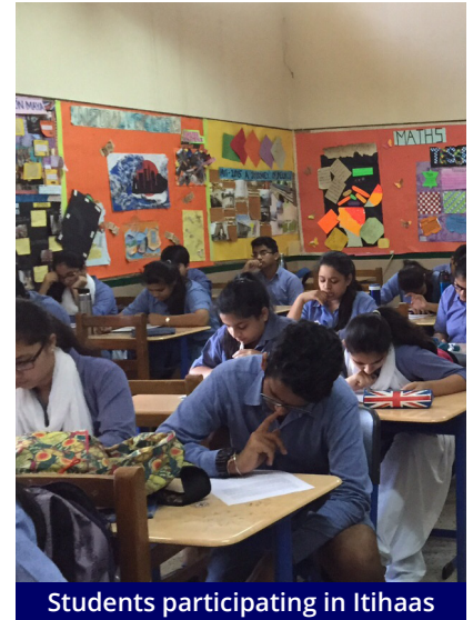
Students participating in Itihaas

The History Department of Modern School, Barakhamba Road in collaboration with 'Itihaas', an initiative by students of IIT Delhi, attempted to bring history alive as a living and tangible experience. Its aimed to connect students to what they read and relate to. Also see history as something intuitive by developing a deep perception of our past and present. The effort was to broaden the learning of history outside the classroom, as also to understand the intricacies involved in interpreting history and its facts.