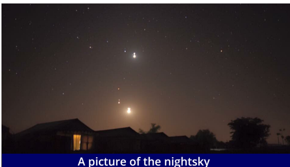
A picture of the night sky

A session on the constellations was held and various aspects linked to them were discussed. Several constellations and stars, the Orion Nebula and the Pleiades cluster were viewed by the students. The students learnt the technique of calculating the altitude and azimuth of a star using fists and a latitude finder.