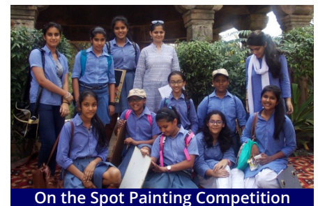
On the Spot Painting Competition

were held on 5th and 6th of October respectively. The students stood overall 3rd in the zoological quiz winning beautiful T - shirts as prizes. It was a great opportunity for all the students to view wildlife.