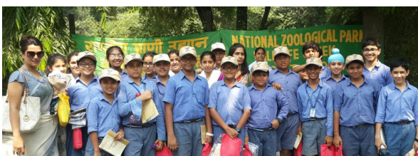
Open Wildlife Quiz

The first week of October was celebrated as the Wildlife Week. The celebrations took place at the National Zoological Park, Delhi. Students of the middle block participated in an 'On the spot painting competition' and in an 'Open Wildlife Quiz' which