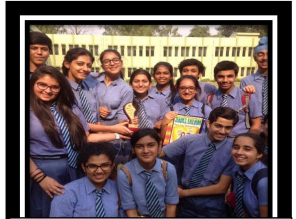
Participants of project citizen.

This year, the Project Citizen team from Modern School selected urban sanitation as its topic. Over a period of time the team explored solutions to the problem of inadequate sanitation, discussed these with concerned officials, and ultimately devised a comprehensive action plan to improve sanitation systems. After preparing a detailed report and painstakingly rehearsing their oral presentation for days, the student team arrived at Ramjas School for the National Showcasing of their project.