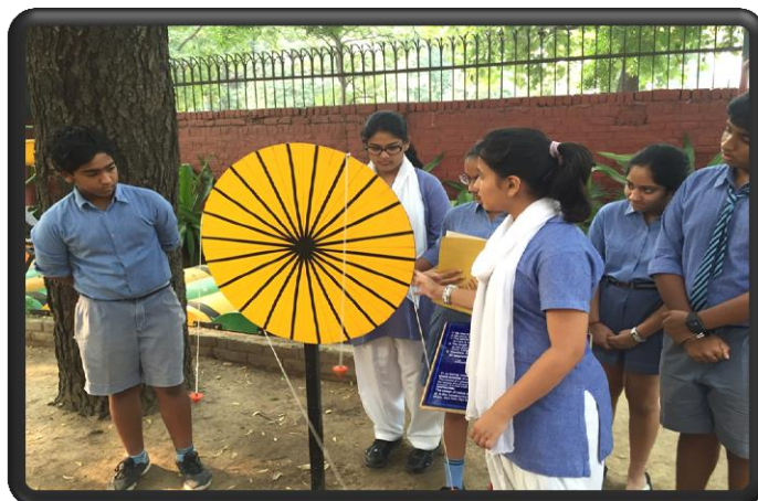
S5 Students at the science park.