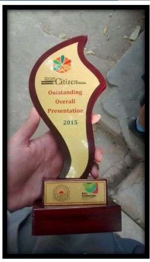
The winning trophy.

After spending four hours waiting with bated breaths, all the students were overjoyed at the result – Outstanding Overall Presentation, in essence the first prize, was awarded to none other than Modern School! Everyone was in a cheerful and elated mood, Project Citizen was an enriching and fruitful experience.