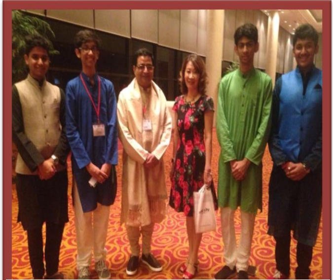
MODERN SCHOOL DELEGATION

The opening ceremony included cultural dance performances and regional songs for entertainment. Dr Vermani presented a paper on "The Best Teaching Practices in Modern School" during the teachers session which was highly appreciated. The conference was truly an enriching experience for the modern school delegation.