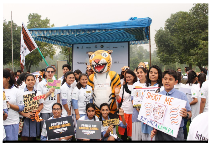
Modern School participants at the International Tiger Day celebrations

On the International Tigers' Day , 29<sup>th</sup> July, 2016, the National Tiger Authority of India supported by the World Wildlife Fund and Kids For Tigers organised a one kilometre walk at India Gate, New Delhi, which was followed by several interesting games. The global aim of the event was to create awareness to help increase the wild tiger population. The Minister of Environment, Mr Anil Madhav Dave flagged off the