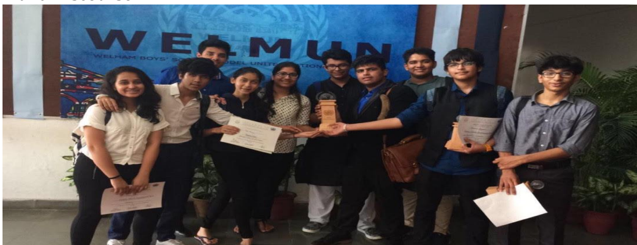
The Modern School Delegation

The event included schools from various states within India and countries abroad. As the legacy of winning continues Modernites emerged victorious with flying colours. Amongst the thirty schools, Modern School Barakhamba Road was the only one whose participant delegates won in their respective committees. We were also honoured with the Best Delegation Award and congratulated for upholding with full adherence their motto of 'Diplomacy and Discourse'