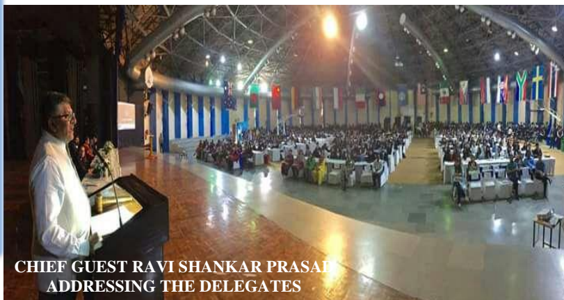
CHIEF GUEST RAVI SHANKAR PRASAD ADDRESSING THE DELEGATES