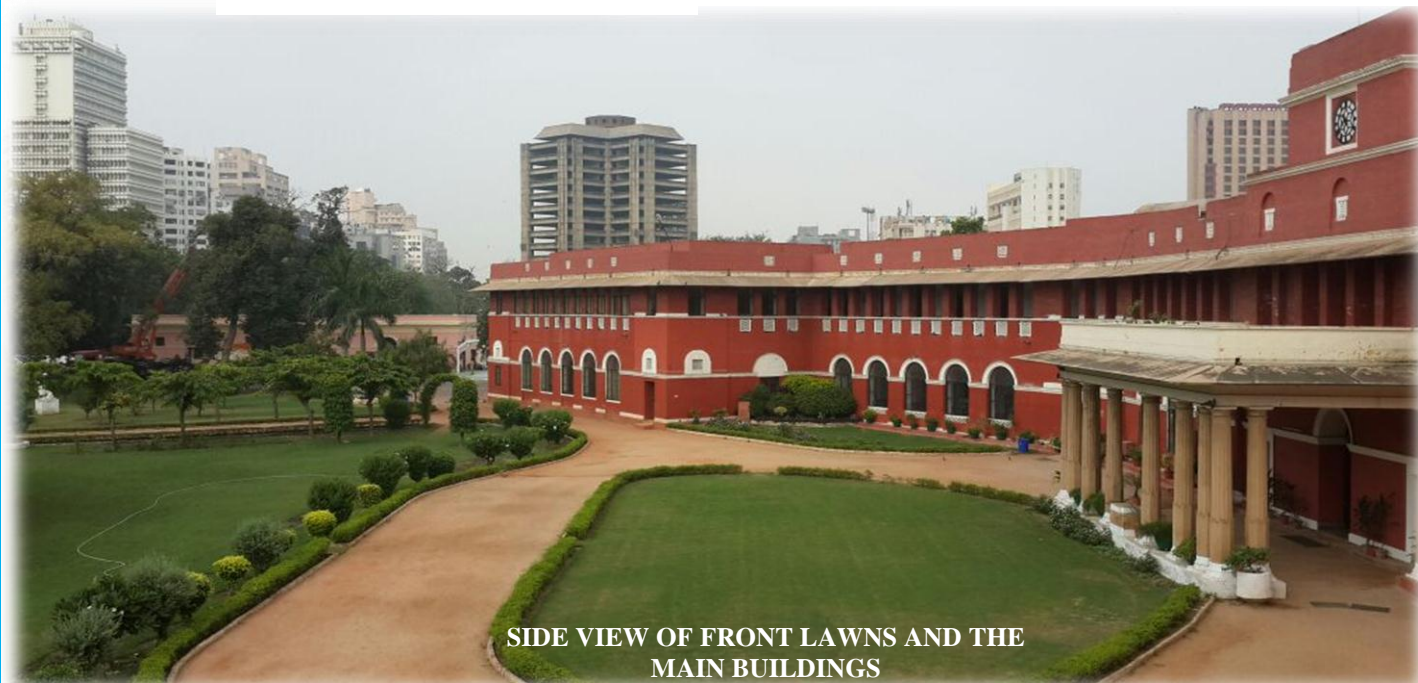
SIDE VIEW OF FRONT LAWNS AND THE MAIN BUILDINGS