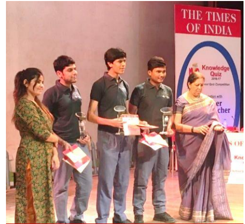
The Team - Modern

Manav Sthali School. With over 100 teams participating in the preliminary round, our school was one of the top 6 teams to make it to the 'stage round'. There, the team fought four tightly contested rounds of quizzing, taking a commanding 40 point lead in the final round and winning the first prize. Our team was awarded trophies, certificates, dictionaries, gift vouchers and a cash prize of Rs 15,000. This victory was in fact a fitting compliment to the school's victory earlier this year at 'InQuizitive' –the Hindustan Times Inter-School Quiz.