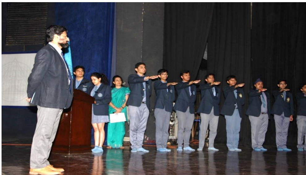
The Prefects of the School

'Prefect' badges were awarded to the deserving students of Modern School batch of 2016-17, in an Investiture Ceremony on 18 th October 2016 during assembly. The proud recipients stood tall and bright eyed as they took an oath to lead by example and hold the Modern School banner high.