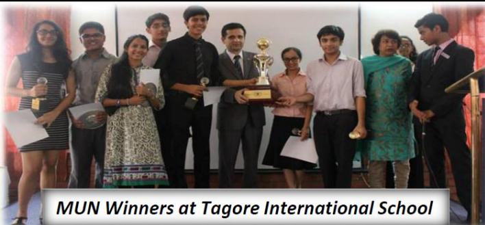
MUN Winners at Tagore International School