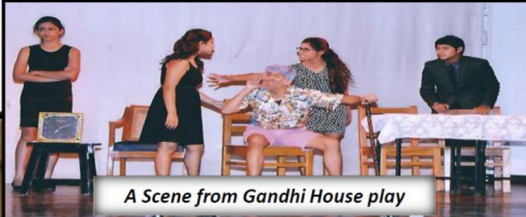
A Scene from Gandhi House play