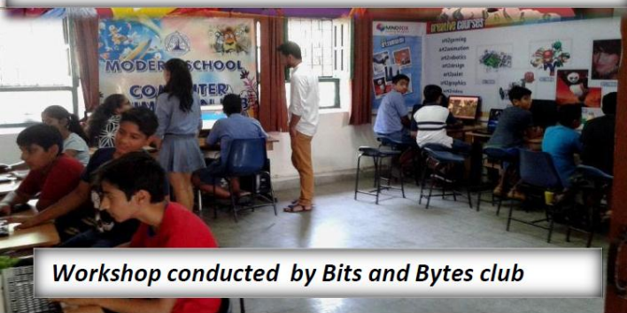
Workshop conducted by Bits and Bytes club

Twenty-nine students benefited immensely from summer workshop conducted by the Paper Technology Department from 18 th to 30 th May 2015. Activities included paper-recycling, paper-making, starching, marbling, mask-making, file-cover making, folders, baskets and a myriad of activities. The last day our esteemed Principal inaugurated the exhibition in the Conference Hall and evinced interest in each and every item on display.