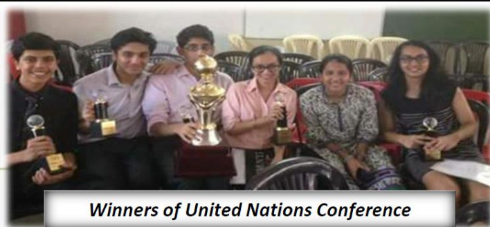
Winners of United Nations Conference