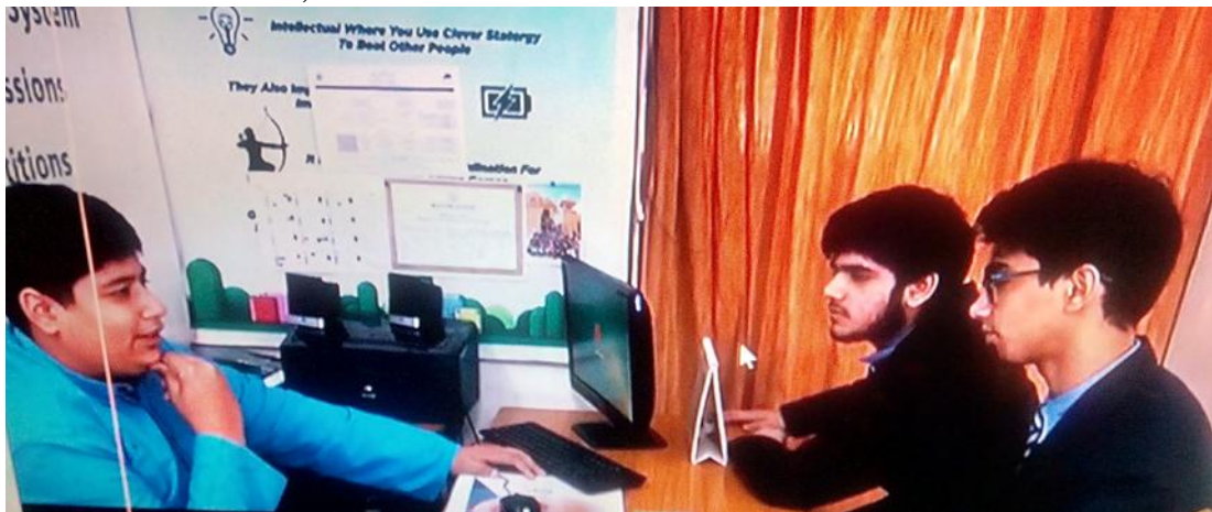
Students enacting the play- The Truly Privileged