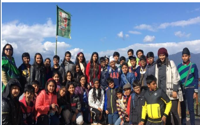
Students enjoying at the Sunset Point

A group of thirty five students from Middle Block went for an educational trip to Gangtok and Darjeeling during the winter break. This splendid trip lasted for 5 nights and 6 days from 5 th January to 10 th January 2017. It included a visit to the beautiful monasteries of Gangtok and Darjeeling, the flower garden in Gangtok, the sunset point with an amazing view of Kanchanjunga mountain range in the backdrop. This trip became even more memorable as students enjoyed the snowfall near the Changu Lake in Gangtok. A visit to the beautiful tea gardens of Darjeeling and sunrise at the famous Tiger Hill made the trip worthwhile.