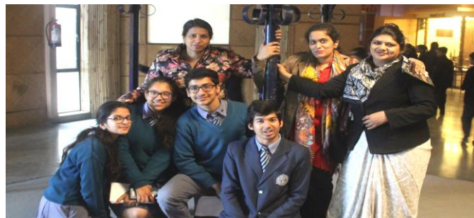
Students at the National Science Centre

other important compounds in a way that was informative and at the same time simple to understand. Models were self-explanatory and provided students with hands-on experience. The students were given a questionnaire on the aspects observed by them. The displays kept students amused and involved. It also triggered their imagination and creativity. The visit to the National Science Centre was an extremely enriching experience for the students.