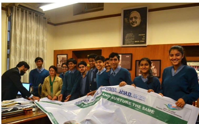
Principal Signing on the poster for the Signature Campaign

The Environment Club of Modern School Barakhamba Road organized a signature campaign in the school premises on Thursday 8 th December 2016. The event saw two giant posters hanging in the school with the pledges inscribed on them- 'I shall buy organic food, coz' it would be for nature's good' and 'I promise to plant a tree on my birthday and nurture it' . The campaign aimed to spread awareness about one of the gravest issues plaguing the Earth- Pollution. The event was an attempt to inspire students to work towards ensuring a cleaner and greener future by doing their bit as every little bit counts and contributes to a better world. The two pledges garnered over 700 signatures.