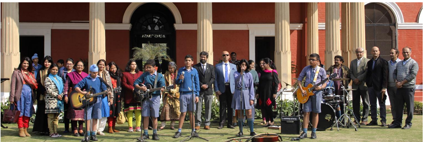
School Band performing in the Front Lawn

The event augurs the sprightly advent of a 'Recess-Rock' concert series that all at Modern School are looking forward to.