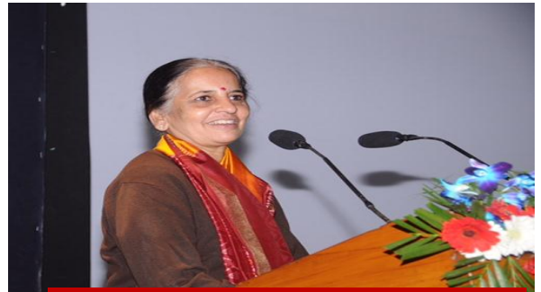
The Chief Guest addressing the audience