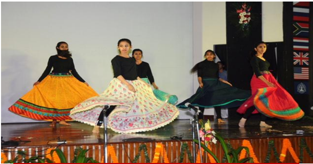
Group Dance by the Shivaji House students