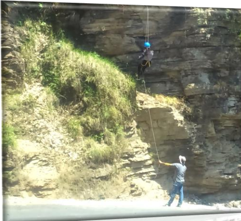
S3's doing Rock Climbing

The S3's from the middle block went on a camping excursion to Chail in Himachal Pradesh and Chandigarh from 22 nd May to 25 th May 2015. Students enjoyed every bit of camping and related activities in Chail. From Rock Climbing to Rappelling or Flying Fox to Crossing the Human Bridge, each and every activity was bravely executed by the children. Students felt living in camps was altogether a very new and different experience. After Chail, the group went off for a brief stay in Chandigarh where, they visited Sukhna Lake and the creative Rock Garden. They enjoyed the beauty of the garden, which has been carved out of waste material. The trip was most enjoyable and insightful.