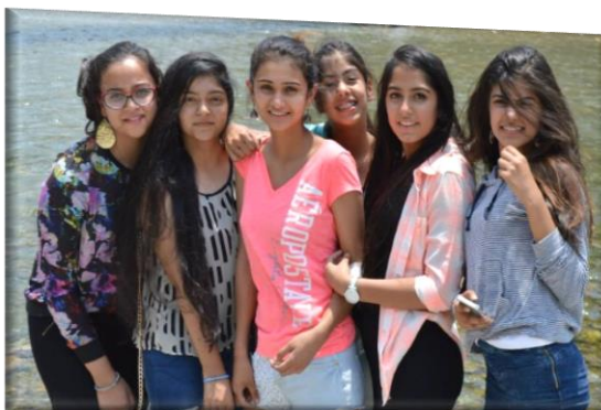
Small Moments, Big Picture!

On the 18 th of May, A group of 30 students of class S5 left for a 4 day school trip to Bhimtal, Nainital and Jim Corbett via road. It took 20 hours for them to reach the hotel. The days that followed were filled with nature walks and exciting activities like rappelling, flying fox and visiting local temples. The students also went for a jungle safari where they saw few of the indigenous species of animals. Tired and exhausted, the students finally came back with wonderful memories to look back upon.