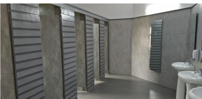
SPECIALLY DESIGNED WASHROOMS FOR STUDENTS AND TEACHERS AT SS BLOCK