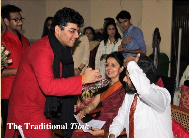
The Traditional Tilak

Teachers' day in Modern School was celebrated on 6 th September. The teachers sang in the assembly displaying their hidden talent and mesmerising everyone with their melodious