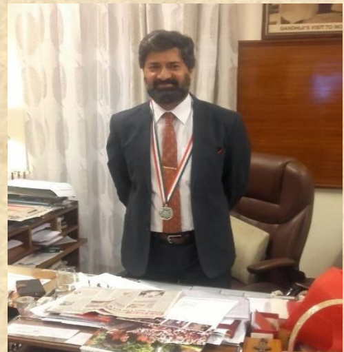
At the Office with the Coveted Medal