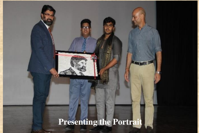
Presenting the Portrait

also contributed to the show with a dance performance. They thanked the Principal and in a touching gesture presented the honourable Principal with his portrait. Teachers' day will be cherished by every Modernite as a special day in their memories.