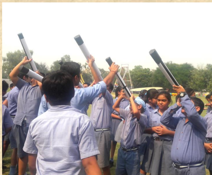
Students Observing the Sun Using a Telescope

Sun's 11 year cycle and its differential motion which causes entanglement of the Sun's magnetic fields leading to more majestic solar phenomena. They were taken to the field where the instructor took a leaf and placed it on the eyepiece of a refractive telescope pointed towards the sun. The leaf started to burn. They were warned not to use the telescope without the solar filters. With the help of filters they were able to observe the sun. The sun appeared like a round orange ball with irregular spots visible on the surface. These were sunspots. They were told that by using tips and tricks and by experimentation they would be able to measure the earth's circumference.