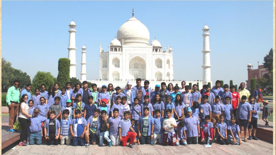
Students at the Taj Mahal Agra

Students spent a pleasant evening at the Sound and light show at the Amber Fort. The rocky walls of the fort provided an amazing backdrop for the light effects. They narrate the story of Rajputs, describe the traditions and the grand lifestyle of the royal family. The next day students visited the Jantar Mantar which features the world's largest stone sundial, and is a UNESCO World Heritage Site.