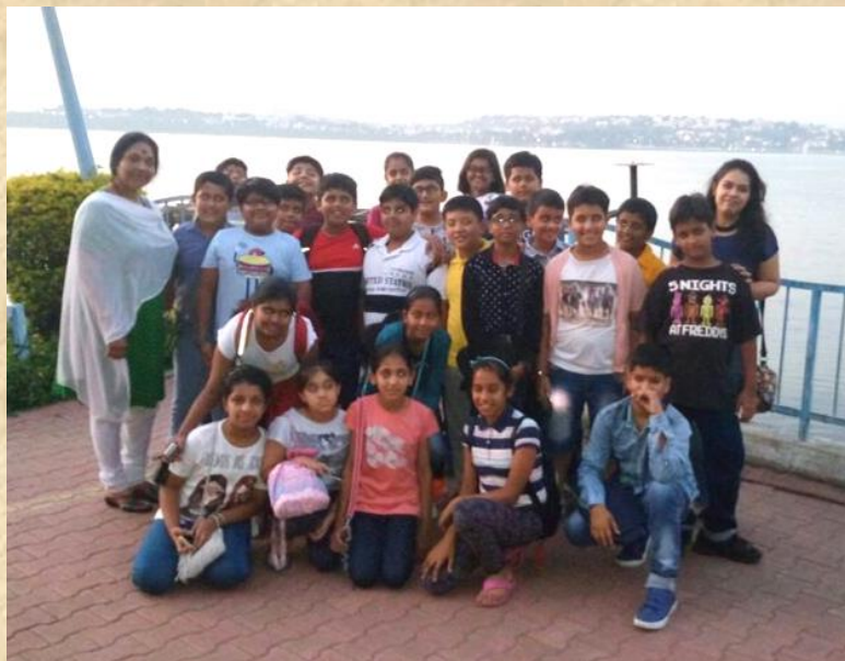
Students at the Bada Lake in Bhopal

A four day trip from 28 th September to 1 st October 2017 was organized for students of class S1 to Bhopal, Sanchi, Udaigiri and Bhimbetka. They visited Sanchi Stupa, Udaigiri and Bhimbetka Caves which was an informative experience and presented a glint of history. They visited the Bada Lake, Bhojpur Temple and Taj-ul- Masjid. Students and teachers enjoyed shopping at the famous Bhopal Main Market. They also had fun at the Art Gallery where they were exposed to cultural surroundings, contemporary art and got an insight of various art forms. Overall it was an exciting educational trip.