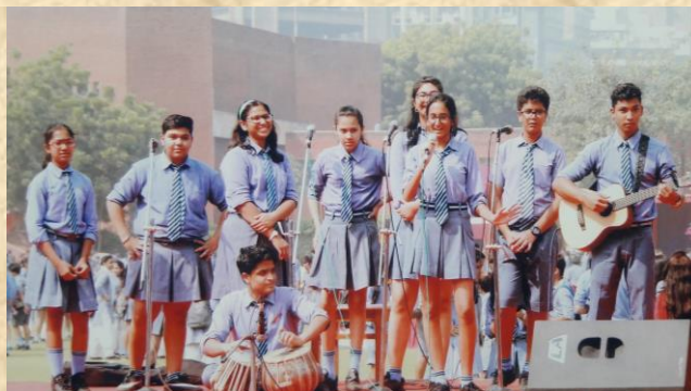
Group Performance at the Inter House Music Festival

buying spree. There were a range of activities like Break the Pyramid, Tear the Paper, Dart Game, Coin in the Bucket, Rice and Button along with Horse and Camel rides. The swings and the roller coaster rides attracted students and added to their excitement. Stalls offering various food items were a part of the fete and were relished by all. The festivities at Modern School